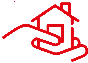
Property & Casualty